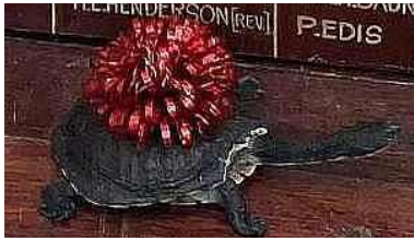
Lady "Petunia at the PVASA Members Xmas Lunch 2026