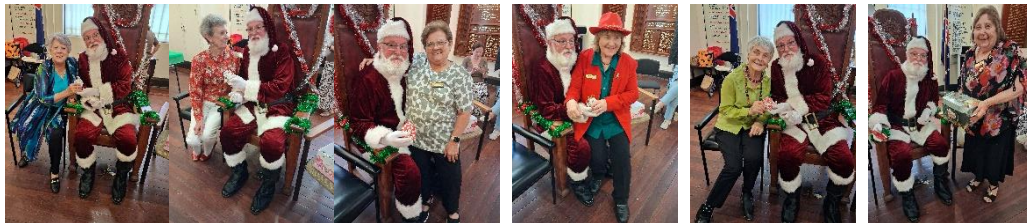
Our Xmas Raffle Draw Winner